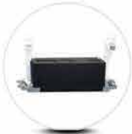
Industrial Print Head 5 Picoliter Adjustable Drop Size