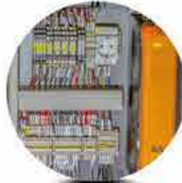
PLC Technology German Electronics