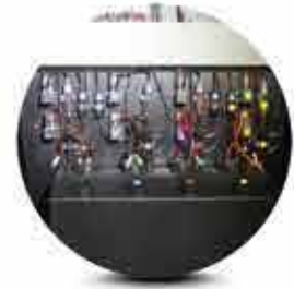
Ink Type: Sublimation & Pigment